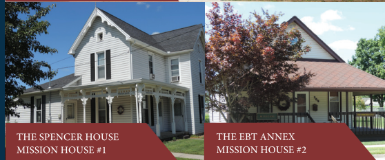
THE SPENCER HOUSE MISSION HOUSE #1