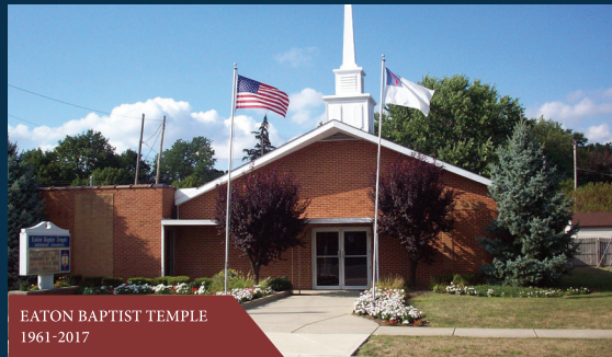
EATON BAPTIST TEMPLE 1961-2017

"Precious in the sight of the LORD is the death of his saints." Psalm 116:15